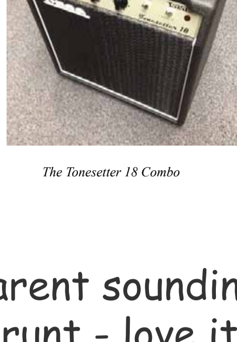
The Tonesetter 18 Combo

“A really supportive and transparent sounding amp with plenty of sizzle and grunt - love it.”