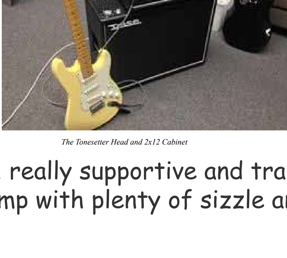
The Tonesetter Head and 2x12 Cabinet

The new VASE Tonesetter 18 is going to offer you some choice. There are three components and you can opt for the configuration that best suits your situation. Available will be the Combo, and a head and cabinet that can be purchased together or individually.